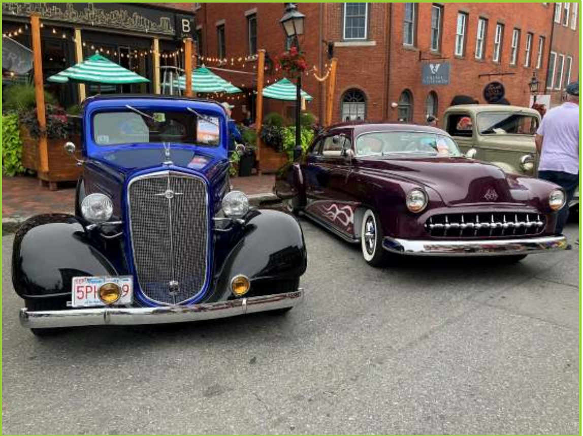
Our Victorian number plates have "Victoria - Education State". New Hampshire has "Live Free or Die".